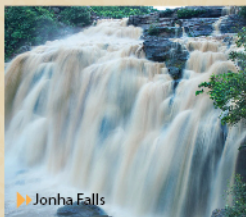
▶▶ Jonha Falls