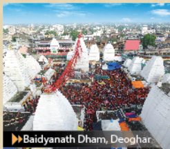
▶▶ Baidyanath Dham, Deoghar