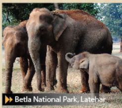
▶▶ Betla National Park, Latehar