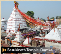
▶▶ Basukinath Temple, Dumka