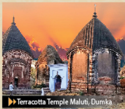
▶▶ Terracotta Temple Maluti, Dumka