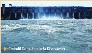
▶▶ Chandil Dam, Seraikela Kharsawan