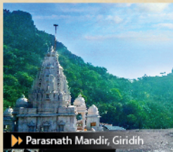
▶▶ Parasnath Mandir, Giridih