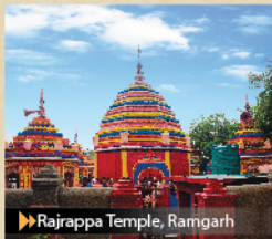
▶▶ Rajrappa Temple, Ramgarh