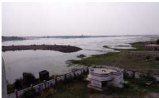
View from terrace