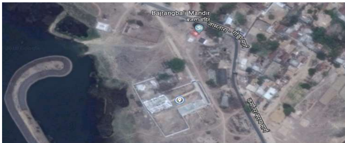
Figure 2: Tourist Complex, Sikatiya

The property is surrounded by major tourist attractions and social connects, especially a water body. Due to this, there is a footfall of tourists around the property in peak seasons and weekends. However, the property is still in non-operational mode and requires basic investments viz. television sets; surveillance cameras, provision of air conditioners, restaurant setup, purchase of beds and cots, manpower mobilisation (Cook, staffs etc.,) and other upgradation of infra works.