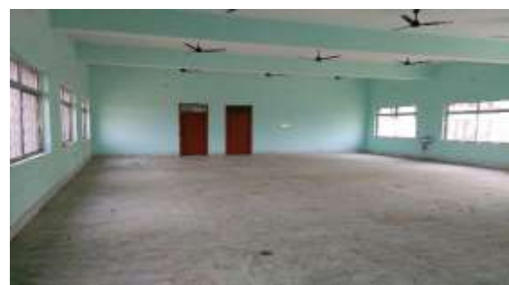
Wide hall space