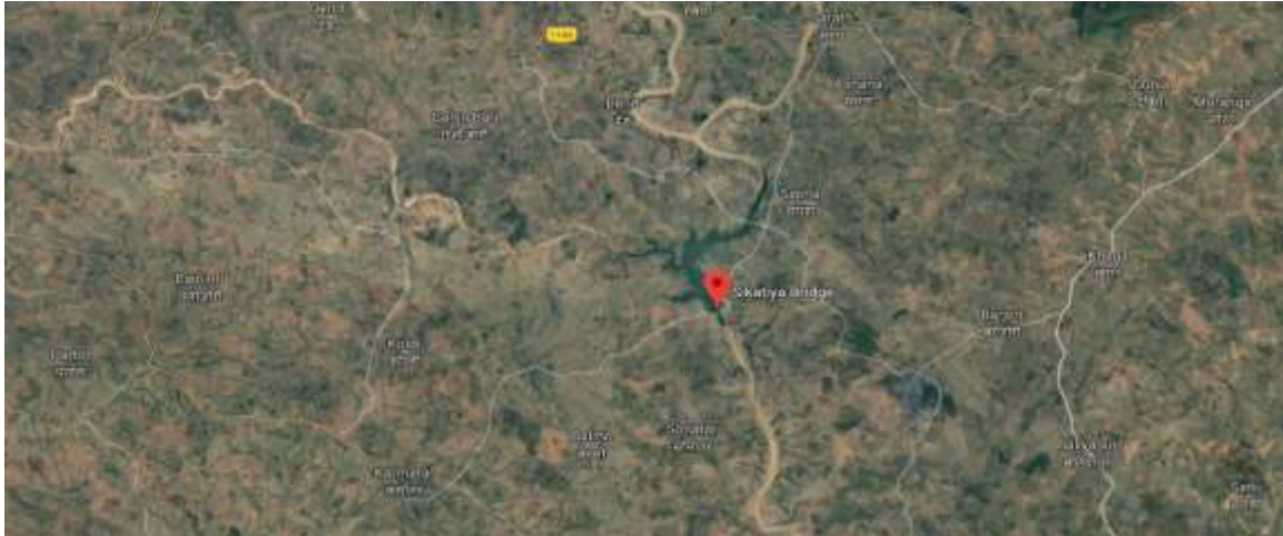
Figure 1: Property location

Way Side Amenities, Sikatiya is located on NH-18 highway. Nearest Bus Station is Mango Bus Station, Jamshedpur.