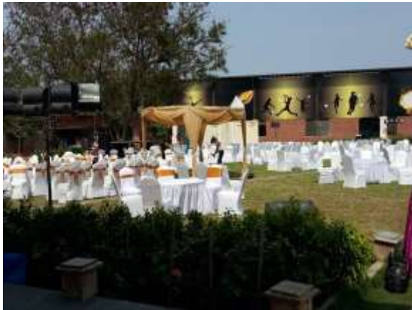
Open banquet hall