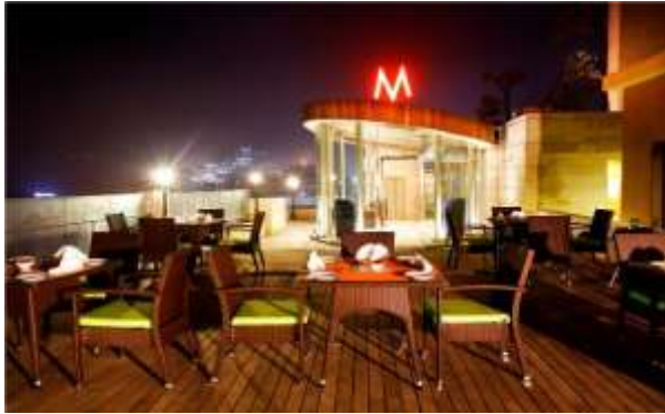
Open Terrace Restaurant