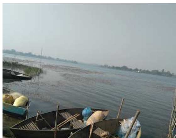
Boats near barrage