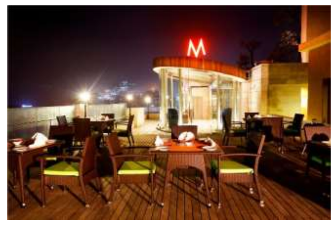
Open Terrace Restaurant