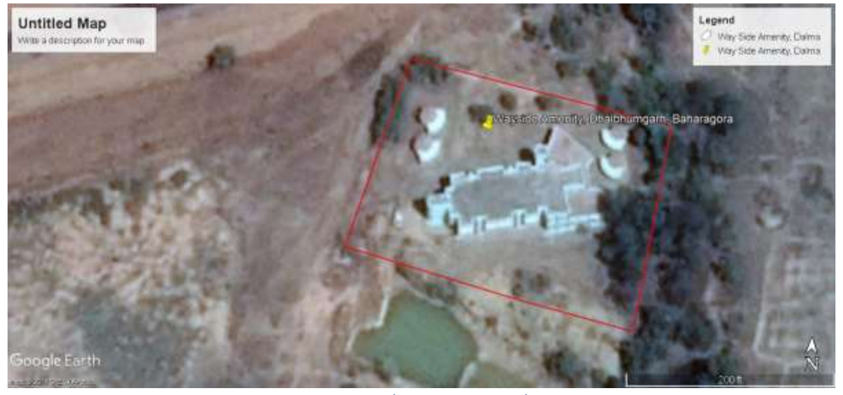
Figure 2: Way Side Amenities, Baharagora

The property is surrounded by some temples and limited tourist spots. The tourists can reach the West Bengal within 40 mins of travel from the property. However, the property requires some basic investments and viz. television sets; surveillance cameras, installation of air conditioners, restaurant setup, purchase of beds and cots, manpower mobilisation (Cook, staffs etc.,) and other minor upgradation of infra works