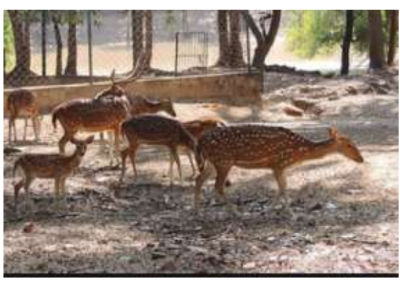
Figure 3: Some tourist attraction spots