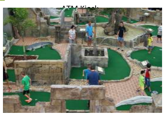
Mini Golf play area