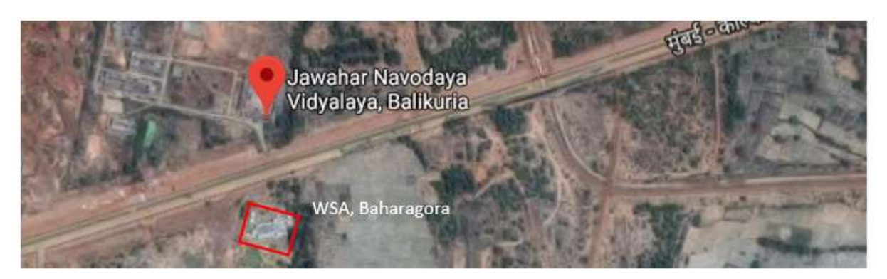
Figure 1: Property location

Way Side Amenities, Bahargora is located in East Singhbum district near Jawahar Navodaya Vidyalaya. The subject property is located on NH-6 (Mumbai-Kolkata) highway.