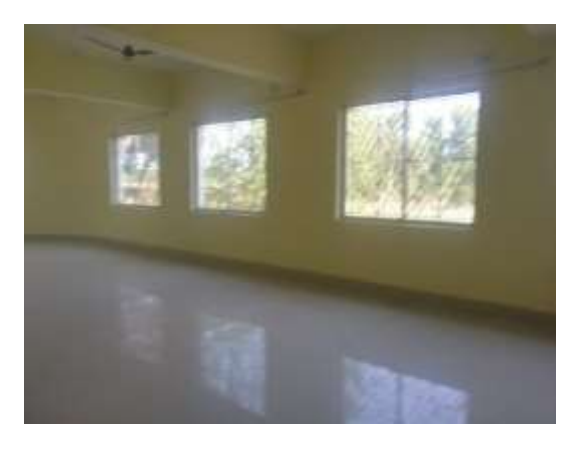
Conference hall/ party hall